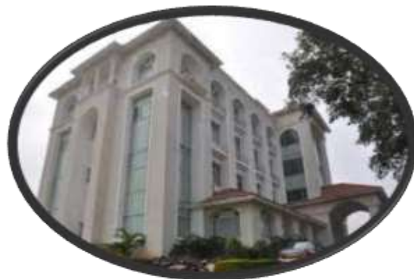
College Park Campus, Road No. 3, Banjara Hills, Hyderabad