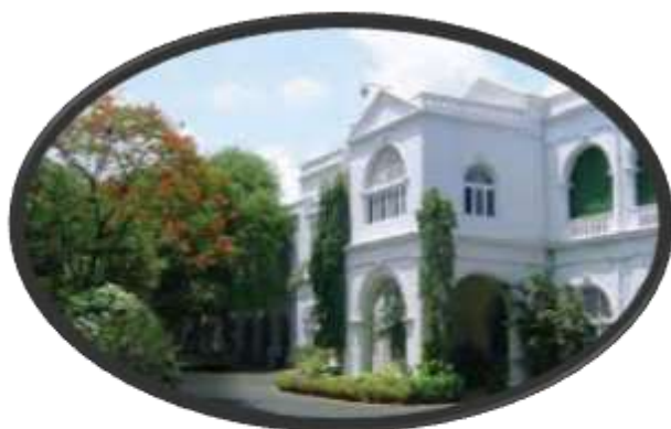
Raj Bhavan Road, Bella Vista, Khairatabad, Hyderabad