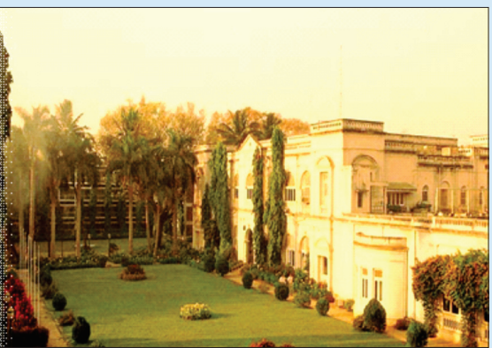
The Bella Vista Campus of ASCI-Erstwhile Palace of the Prince of Berar