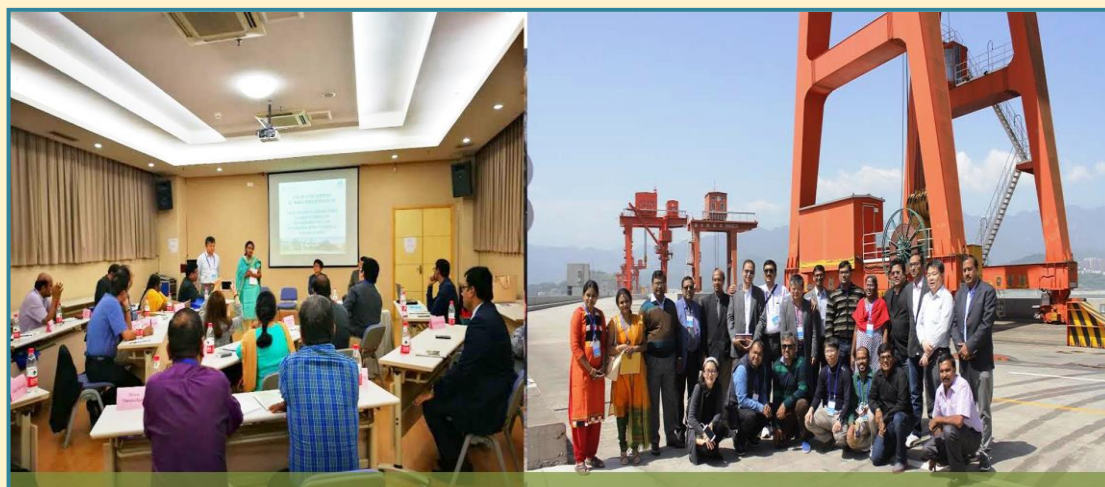
ASCI-NRCR Joint Certificate Course: Participants at Site of World's Largest Hydro-project- The Three Gorges Project, China (Held every year Annually 2017-18 to 2019-20)