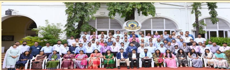
Course on Avoiding Costly Mistakes in Land Acquisition and Resettlement (October 10-14, 2022) Centre for Management of LARR (CMLARR) Administrative Staff College of India, Hyderabad, India