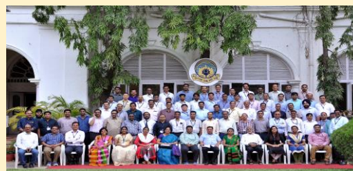
Five-day LARR Course, October 2019 89 Nominations