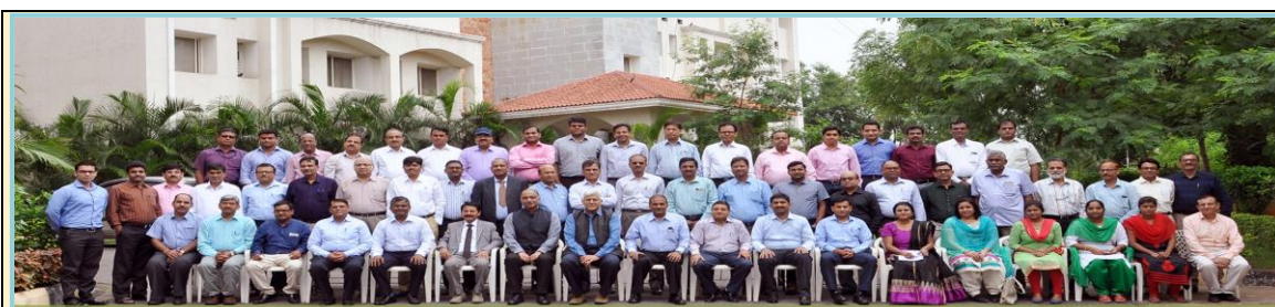
National Conference on Land Acquisition for Infrastructure Projects, August, 16-17, 2017