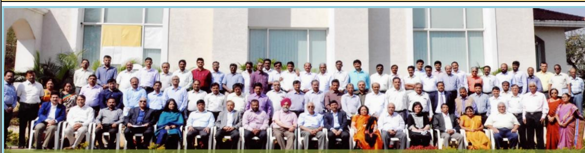
National Conference on RFCTLARR Act, 2013, February 17-18, 2014