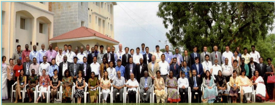
International Conference on R & R and Benefit Sharing, May 20-24, 2013

"Let us be together, let us interact together, and may our minds comprehend together"