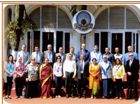
Team of Egyptian Senior Government Officials at ASCI in March 2016