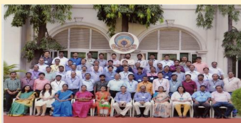
Five-day LARR Course, October 2015 75 Nominations