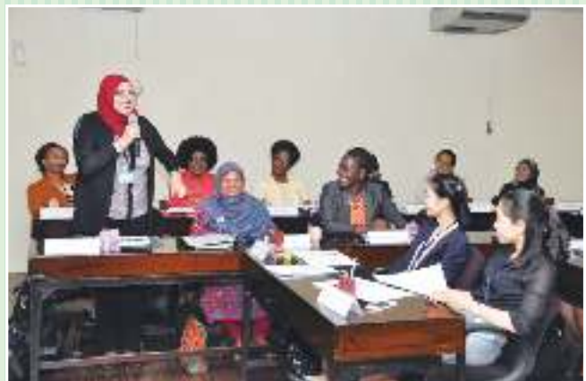
October 9, 2017: International participants engaged in a discussion during a programme on "Change Makers", Sponsored by the Ministry of External Affairs, at Bella Vista