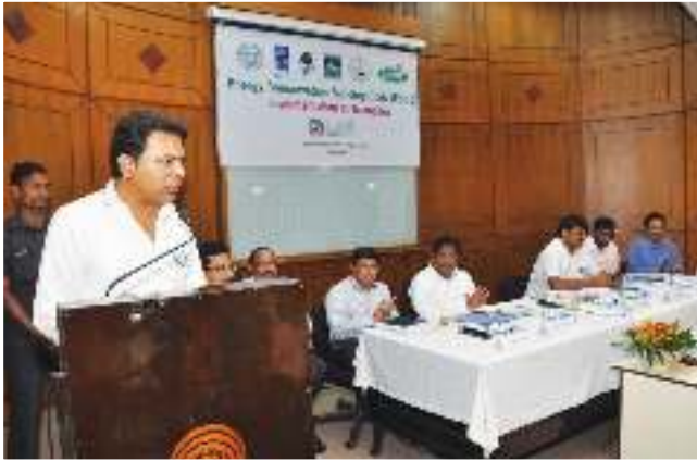
Jan 6, 2018: Mr. K.T Rama Rao, Minister for Municipal Administration and Urban Development, Industry & Commerce, IT, Handlooms & Textiles, Mining, NRI Affairs, Govt of Telangana, addressing a gathering in Bella Vista during the Third Party Assessors License Distribution Function related to Energy Conservation Building Code (ECBC)