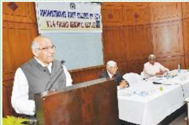
Feb 1, 2018: Dr YV Reddy, Former Governor, Reserve Bank of India (RBI), delivering 'KLN Prasad Memorial Lecture' on the "State of Banking" at Bella Vista