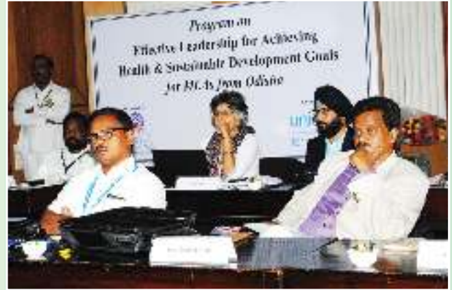
Nov 9, 2017: Odisha MLAs attending a programme on "Effective Leadership for Achieving Health and Sustainable Development Goals" at Bella Vista