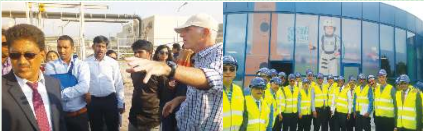
Participants of ASCI's programmes with an international component during a visit in Italy in September, 2017 (right) and Israel (left) in November, 2017