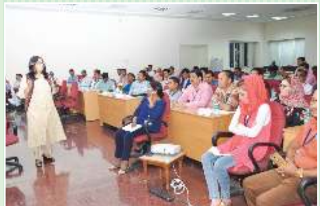
November 9, 2017: Participants from various countries taking part in training sessions on World Bank Procurement at College Park Campus