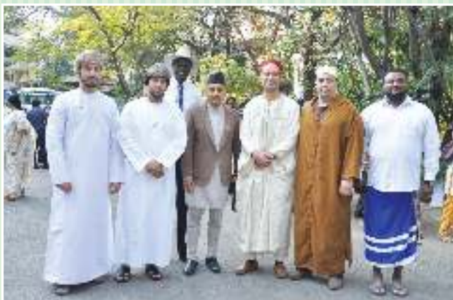
January 26, 2018: International participants taking part in Republic Day celebrations at Bella Vista