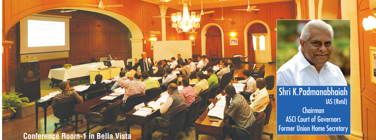
Conference Room-1 in Bella Vista