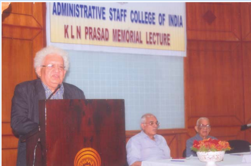
◀ Lord Meghnad Desai, Global Dimensions Programme Director, London School of Economics, delivering the KLN Prasad Memorial Lecture on “Could the Indian Economy Do Better?”, 7 April 2012.