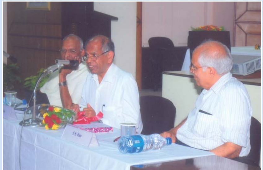
▶ Shri. K. P. Fabian, Former Ambassador to Italy, Finland and Qatar, addressing an interactive discussion on “India's Foreign Policy: The Big Picture”, 4 May 2012.