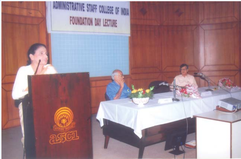
◀ Dr. V. S. Rama Devi, Member, Court of Governors, ASCI, former Governor of Karnataka & Himachal Pradesh, delivering the ASCI Foundation Day Lecture on “Need for Second Renaissance”, 5 Dec 2012.